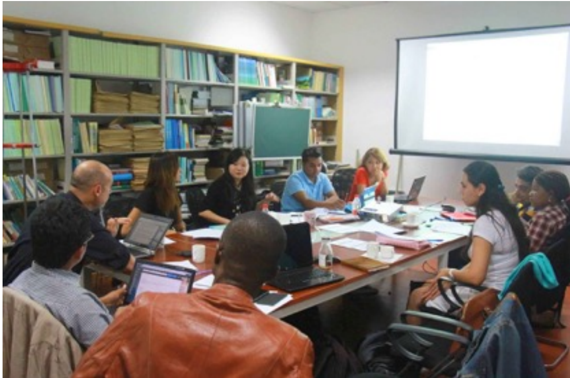
Figure 4: During Discussion and Update Conference Agenda