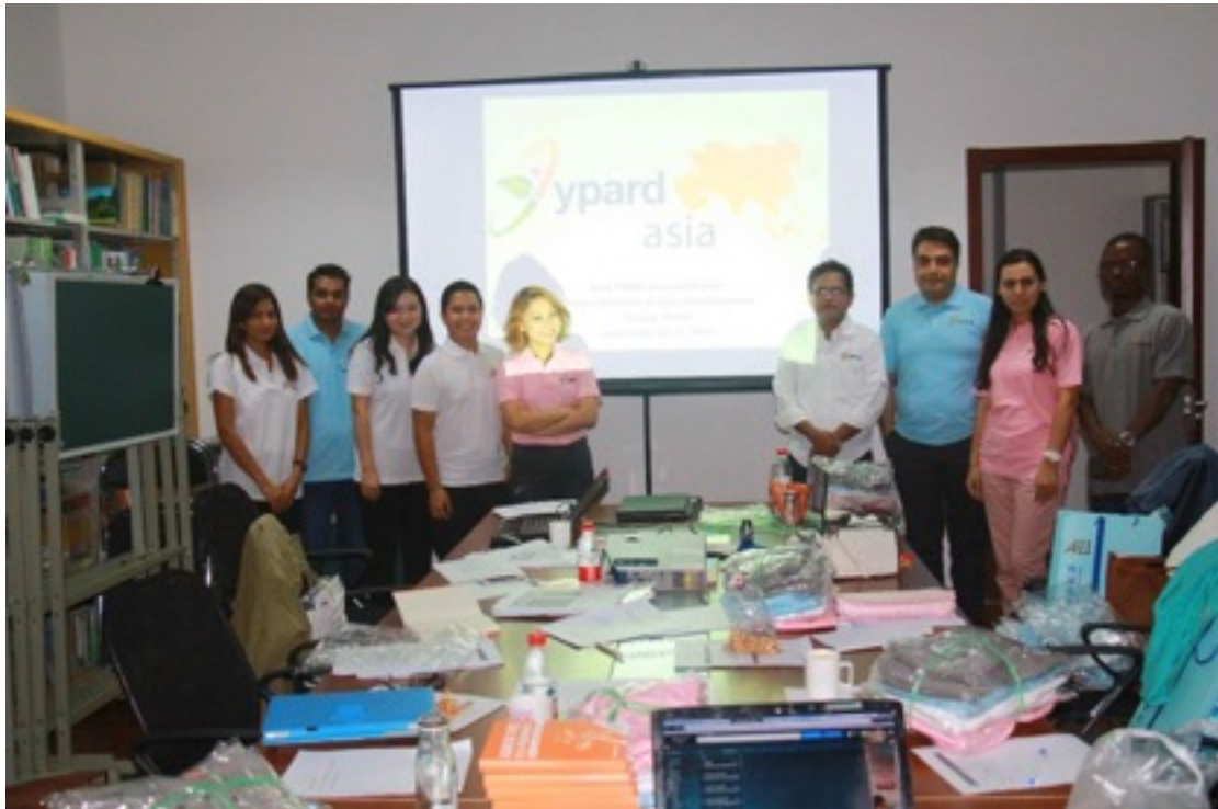
Figure 5: Group Photo, working team from YPARD Asia and Pacific Development Plan