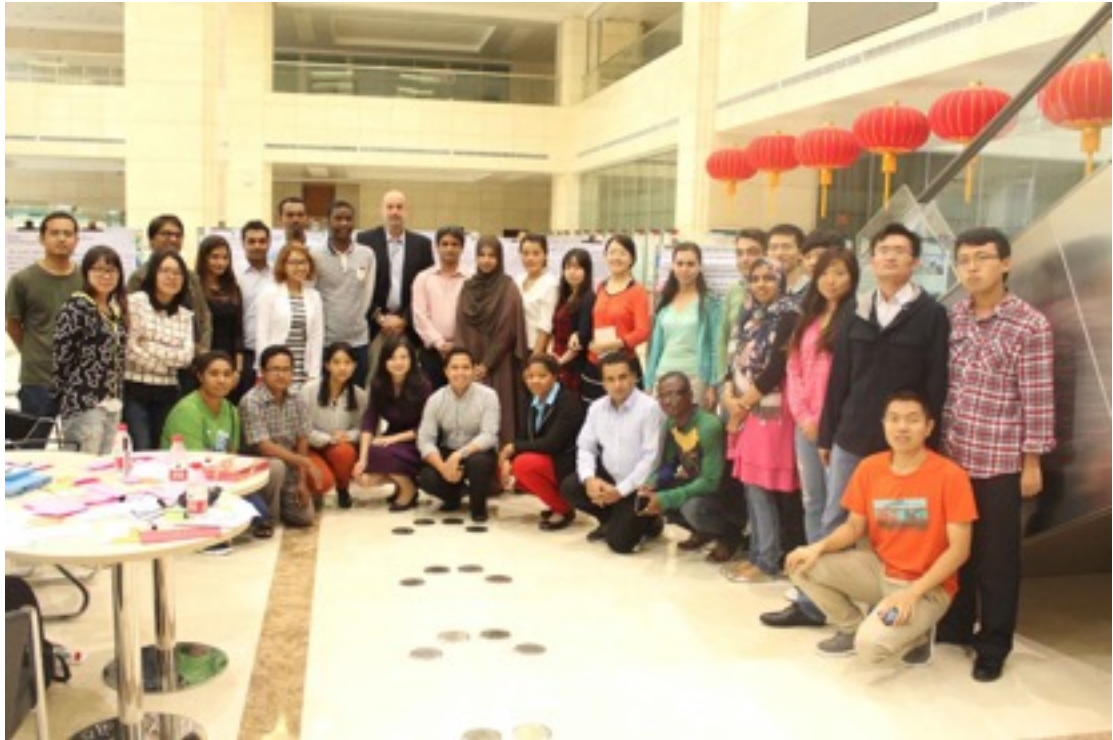
Figure 2: Participants from YPARD Asia Foresight and Planning Workshop