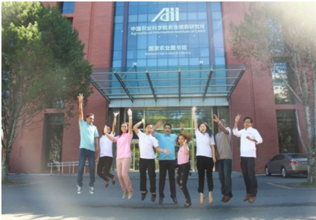
Figure 1: YPARD Asia and Pacific Country Representatives and other participants

Some photos from 1 st YPARD Asia and Pacific Conference, 10 th -12 th September 2015, CAAS, China.